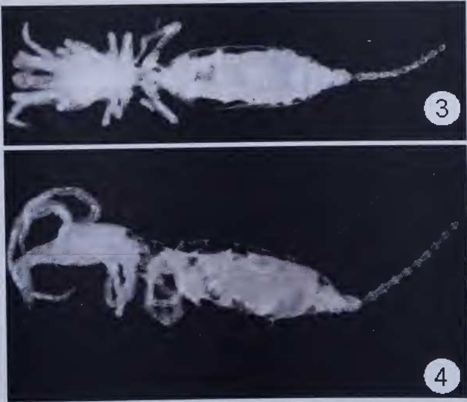
Figures 3–4 Eukoenenia mirabilis , female (WAM T55860): 3, dorsal aspect. 4, lateral aspect. Note that some of the flagellum has been lost.

Eukoenenia mirabilis was first recorded from Sicily (Grassi 1886; Grassi and Calandruccio 1885) and has been subsequently reported from many other localities in the Mediterranean region ranging from the Canary Islands and Madeira in the west to Israel in the east (Figures 1, 2). The most northerly records are from France but these are based upon specimens collected from artificial environments